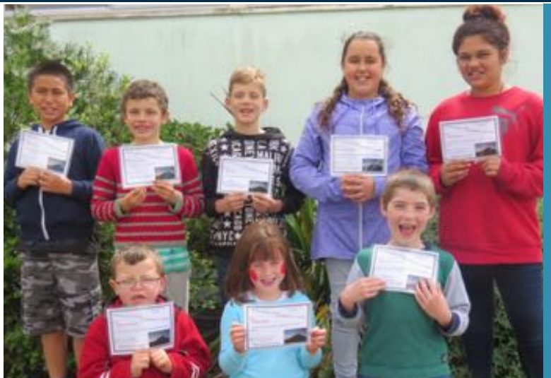
Room 1 news...Our Garden

Room 1 is delighted with their garden. With the spring weather everything is growing. We have planted daffodils, pansies, primulas, lavender, rosemary, parsley, celery, tomatoes, carrots, beetroot, capsicum, cabbage, cauliflower, broccoli, strawberries,